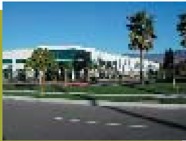
Redlands Commerce Center Inland Empire, CA

Pattillo developments can be found in nearly every major distribution market across the United States. A Pattillo project is easily recognized by its state-of-the-art design and features while offering its occupant maximum flexibility and efficiency.