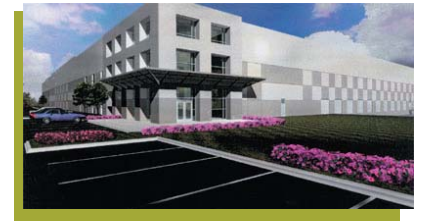
Cedar Grove Business Park

Pattillo Industrial Partners is building upon the foundation laid by Robert Pattillo Properties over the past 50 years.